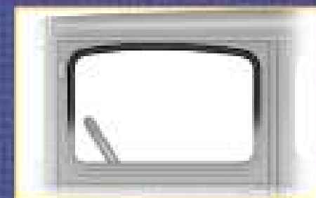
Murray: arched top of door window opening